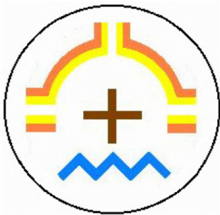
The Correllium, symbol of the Correllian Tradition showing the vault of heaven with a double line representing Air and Light (Fire), the cross of the Four Directions representing Earth, and a wave representing Water. The whole represents the Unity of Existence.

The Correllian Tradition emphasizes celebratory as well as initiatory Wicca, and is strongly committed to accessible public ritual.